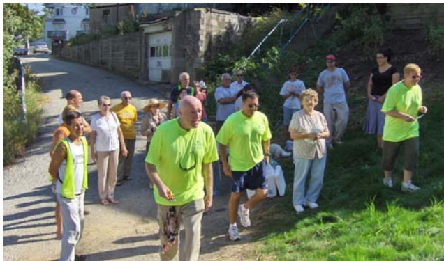
Crowd for the October 6 th Ribbon Cutting