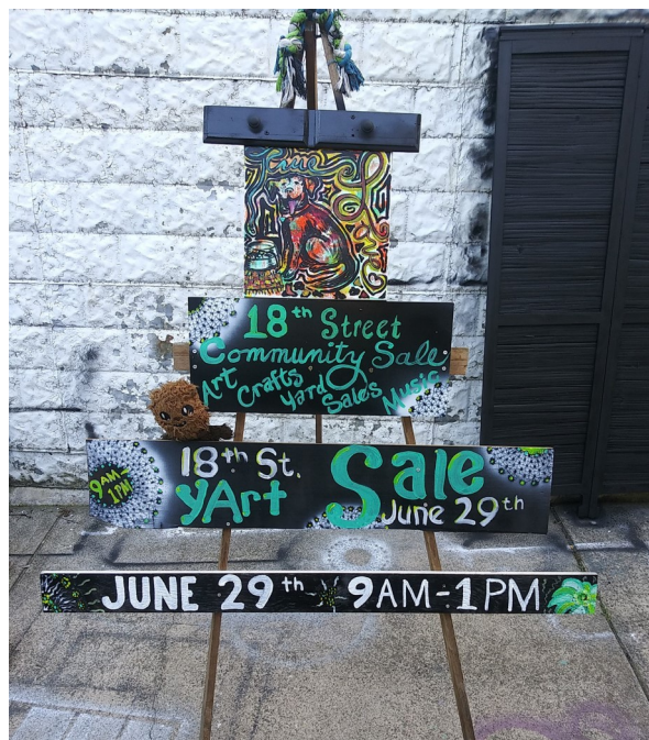
Above: On Saturday, June 29 all along 18th Street from Diamond in the Ruff on Mary Street up the hill to Arlington Avenue, neighbors, artist and friends will be holding the first annual 18th Street YArt Sale from 9 a.m. to 1 p.m. Arts, crafts and yard sale treasures galore!