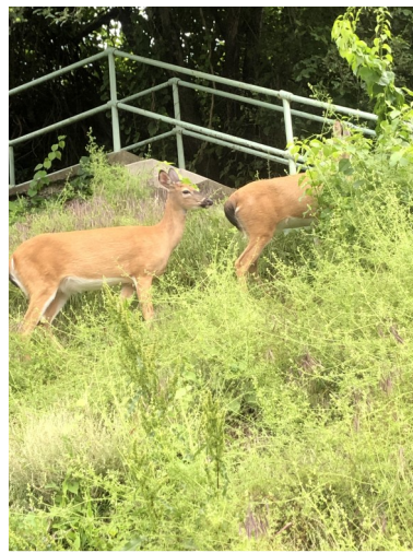
On left: Two young deer spotted in scaling the hillside (and using the city steps?) near the corner of Barry and Mission Streets.