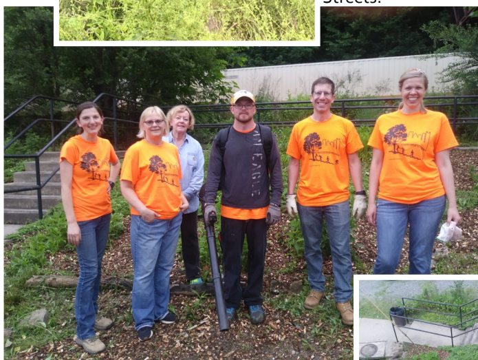
Above: A group picked up trash and cleared weeds and overgrowth at the bottom of the 10th St. steps and bridge. On right: After the cleanup at the corner of 10th & Freyburg Streets.

Join us the first Wednesday of each month at 6 p.m. for about an hour to help cleanup the neighborhood! You can email us info@southsideslopes.org or check the South Side Slopes Facebook page for the next location. (weather permitting)