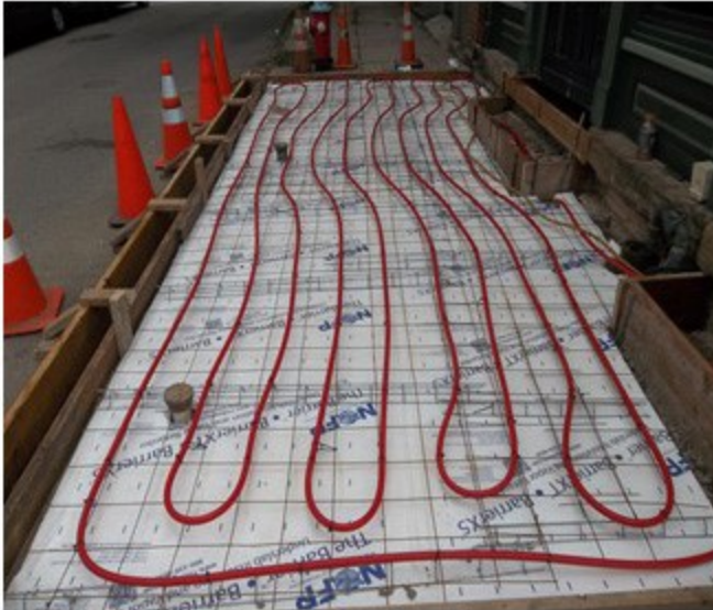
Snow Melt System installed by Phillips Heating.

THINKING OF A NEW SIDEWALK OR DRIVEWAY? Let us melt the snow away!