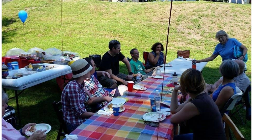
Above: Residents a enjoy a picnic at the Cobden Street Park last summer.

This project addresses the chronic stresses outlined in the Preliminary Resilience Assessment conducted by the City: mobility and transportation access, food