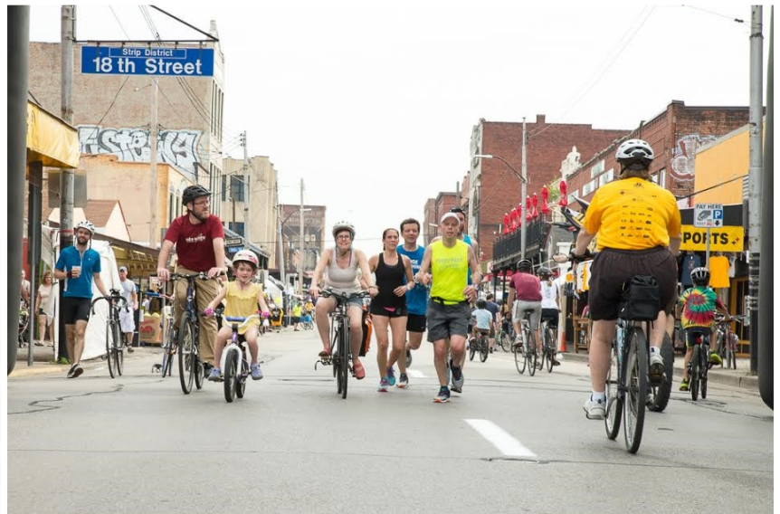
Left and above: OpenStreets-goers enjoying previous events in Downtown and the Strip District.