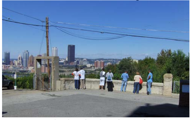
A crowd takes in the view of town.