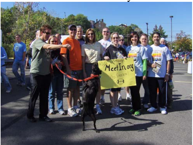
MeetIn.org came to Trek it out!