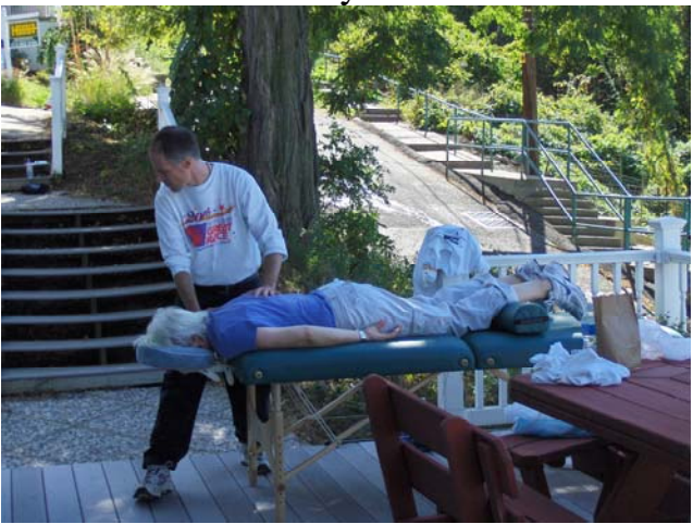
The massage station on the Black Route