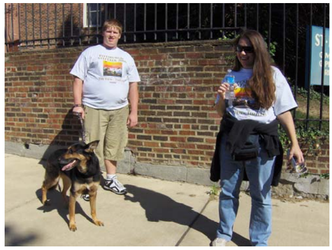
Lots of dogs were Trekking this year