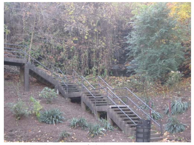
Such a peaceful Autumn scene.