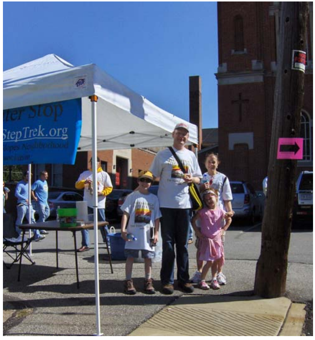
A family at the Monastery water stop