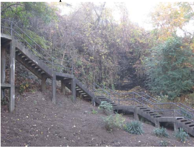
The rich brown mulch looks great with the fall foliage.

As mentioned by Brad, there are many gardening opportunities such as planting, weeding, pruning, and winterizing. You can even simply take a bag to pick up garden litter. SSSNA has six formal gardens and several informal gardens.