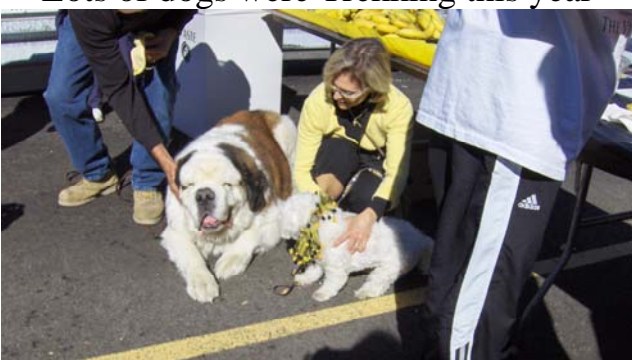
Dogs of all sizes! (Jack on the left)