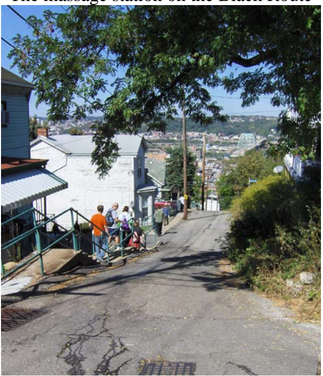
Back to Trekking on a gorgeous day