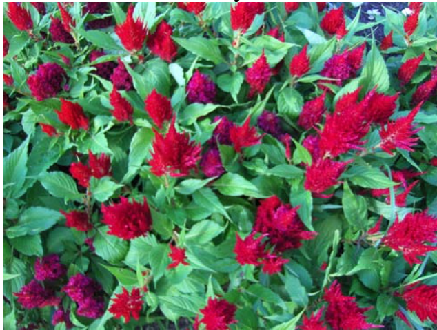
The annuals are starting to take hold