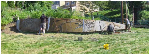
Men at work on 8/6.