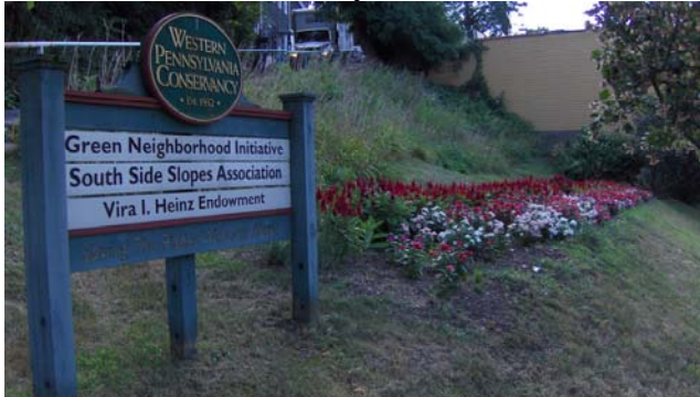
Photos of the Barry Street Garden

Thank you to the folks who have stopped and weeded anonymously. The Greeley Garden and the 18 th Street bend garden have had some weeding done. You are welcome to let us know your time spent, so that we can formally account for it by calling 412-488-0486 or emailing info@SouthSideSlopes.org . The hours translate into dollars when SSSNA approaches funders. You may give your name or remain anonymous.