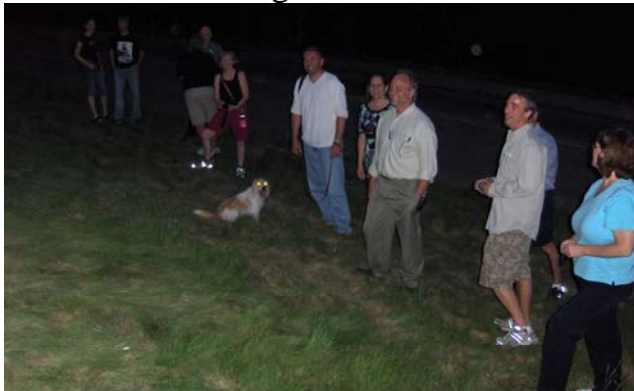
Several neighbor & committee members were there for the first scrim lighting.