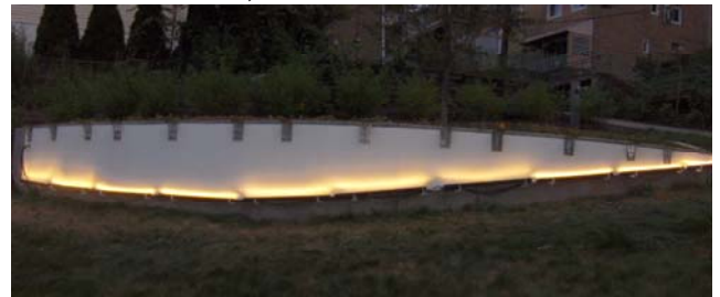
The lights were on at dusk 8/4!