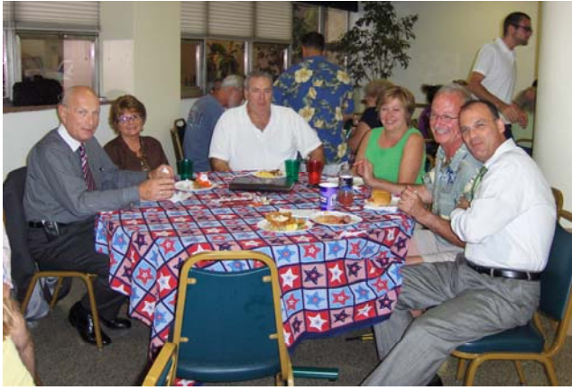
What a great time, had by all.