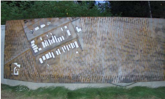
Elm Street logo in the lower left.