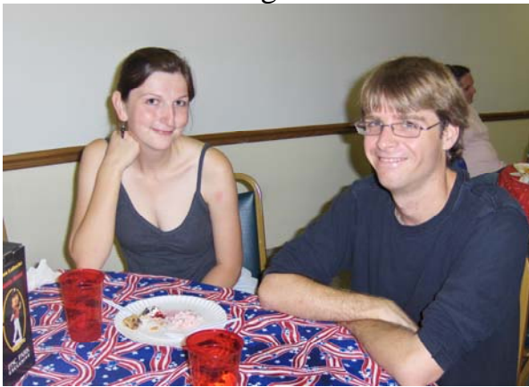
All having fun!