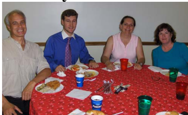
Everyone enjoyed good company & food