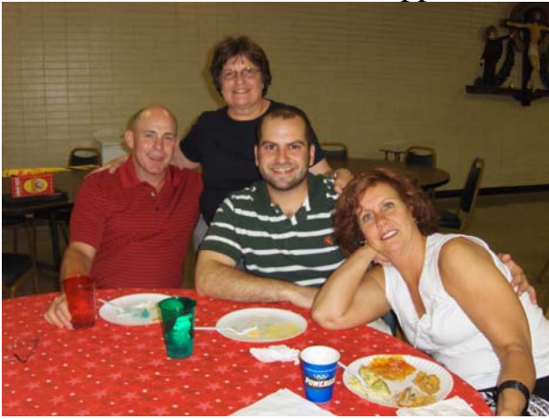
Life long neighbors...