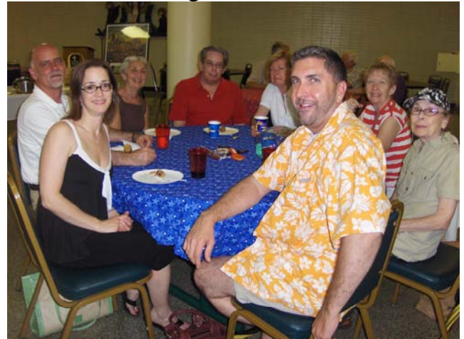
Good discussions all around.