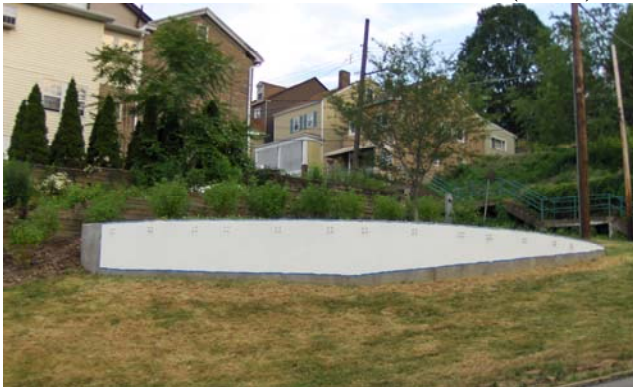
Above – the wall is painted (6/25)