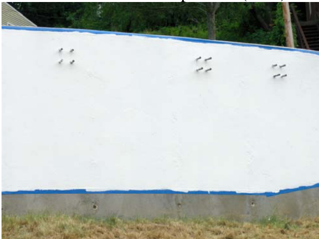
Brackets in place – next is lighting!

There will be much more work in the days and weeks ahead. Keep an eye out! The lighting is being shipped and will be installed soon. After that, the scrim will be placed.