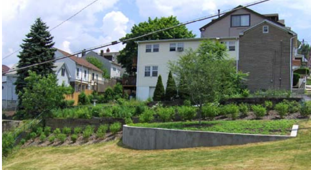
Full garden view from Brosville.

Thank you to the folks who have stopped and weeded anonymously. The Greeley Garden and the 18 th Street bend garden have had some weeding done. You are welcome to let us know your time spent, so that we can formally account for it by calling 412-488-0486 or emailing info@SouthSideSlopes.org . The hours translate into dollars when SSSNA approaches funders. You may give your name or remain anonymous.