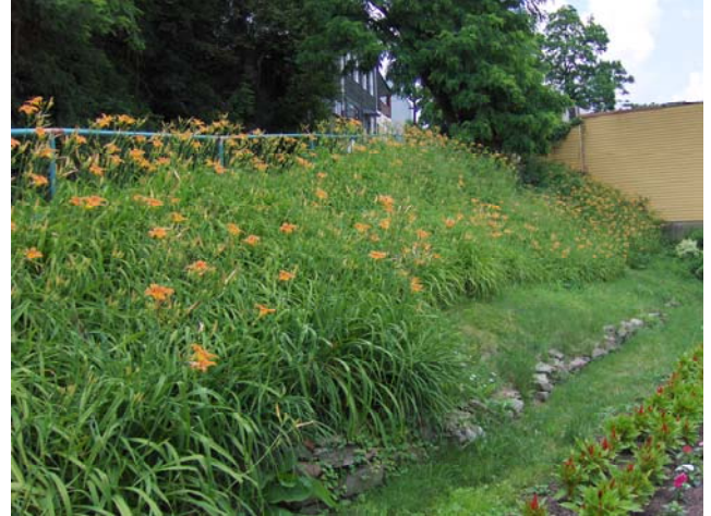
The lilies are in full bloom