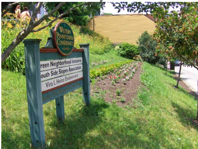
Photos of the Barry Street Garden

Thank you to the folks who have stopped and weeded anonymously. The Greeley Garden and the 18 th Street bend garden have had some weeding done. You are welcome to let us know your time spent, so that we can formally account for it by calling 412-488-0486 or emailing info@SouthSideSlopes.org . The hours translate into dollars when SSSNA approaches funders. You may give your name or remain anonymous.