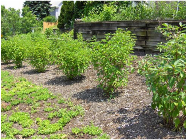
Bushes along the East side of the garden.