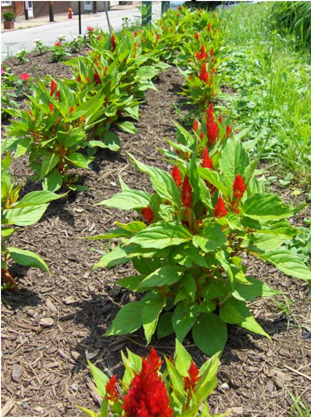
Below an informal garden along Holt Street – thanks Mike!