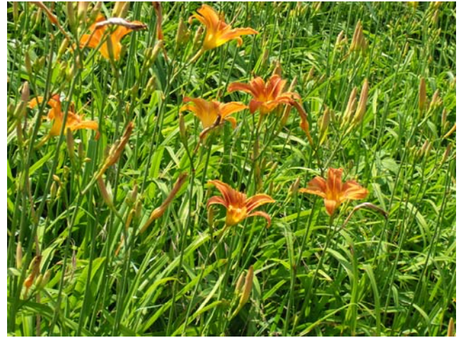
Each year there are more lilies