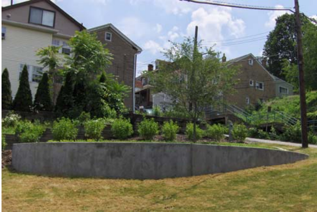
Above – before the scrim work (6/21)