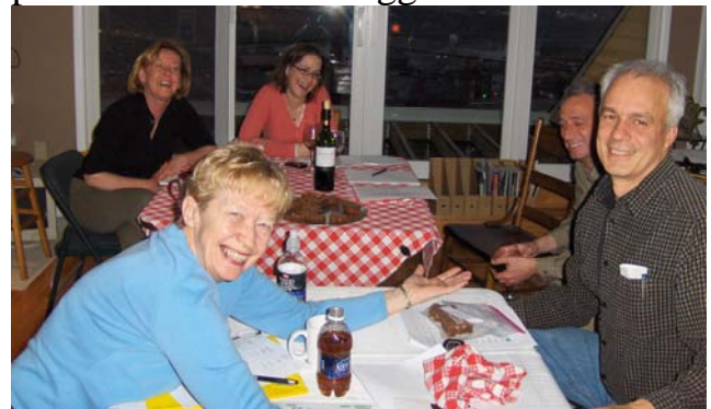
Trek Committee May meeting