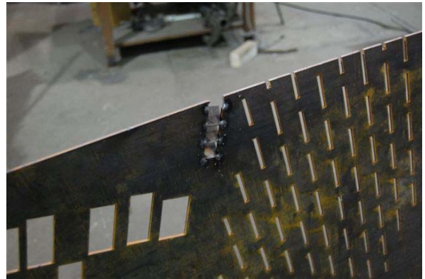
Cor-ten fabrication in progress.