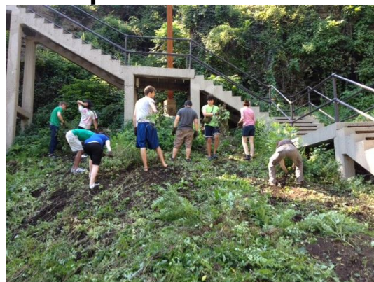
CMU freshmen work on the 18 th Street bend