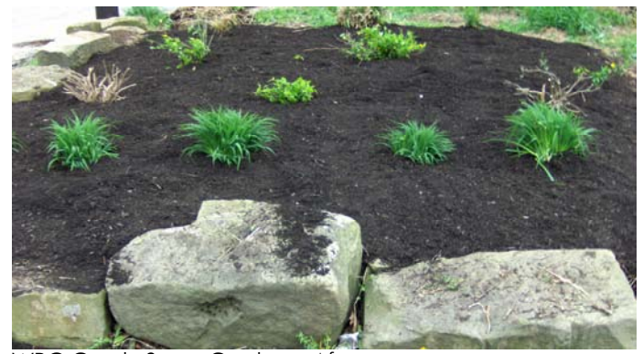
WPC Greely Street Garden – After

There was also a great deal of attention to the Triangle Garden at 18<sup>th</sup> and Josephine Streets. Pitt students spent time cutting back the grasses and plants to prep them for new growth. The garden had new mulch added, and the barrier around the pylon was roped-