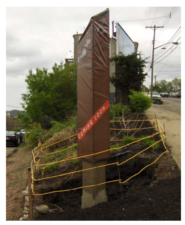
Triangle Garden – 18th and Josephine

off. Last Spring, many volunteers placed new commercial landscape fabric and mulch and this was a wise investment. There were only a minimal amount of weeds. There was fabric placed at Greeley and we hope for the same results.